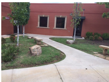
Flowerbed in disarray